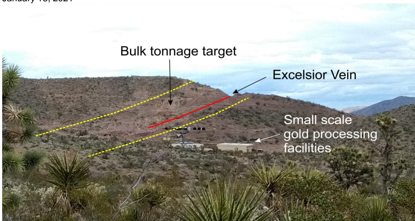
Figure 2. Photograph of the Excelsior Mine looking north showing the bulk tonnage target (between the yellow dashed lines) and Excelsior Vein.