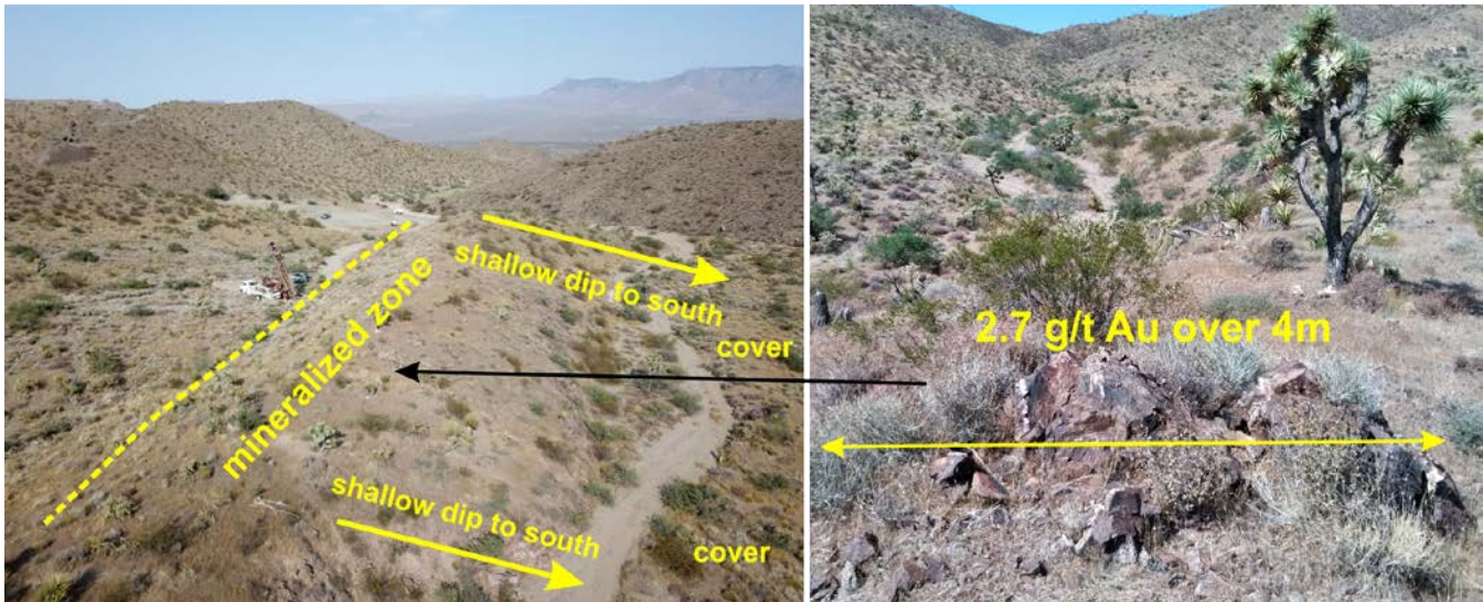
Photographs from the Gold Range Project. Left, view looking east showing the new bulk tonnage target zone at Gold Range. Right, outcrop at top of mineralized ridge containing quartz veined granodiorite gneiss where chip samples returned 2.7 g/t gold over 4 metres.

Drilling in August and September of this year identified near surface bulk tonnage gold potential at the Eldorado Zone with Hole GR20-9 returning 0.9 g/t gold over 27.3 metres including 5.9 g/t gold over 1.5 metres . Hole GR20-8 drilled from the same pad as GR20-9 returned 0.5 g/t gold over 24.4 metres starting from surface. The new discovery correlates with a strong gold in soil anomaly and sheeted quartz veinlets and stockworks within metamorphic rocks.